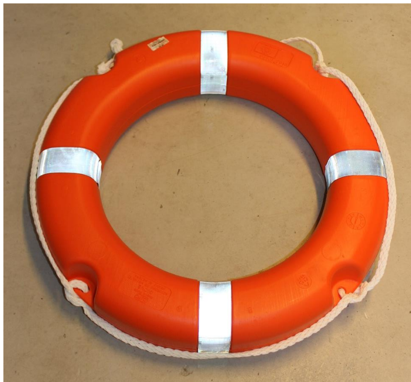
38158 - GIOVE Lifebuoy Ring SOLAS, Ø63cm, 2.5kg